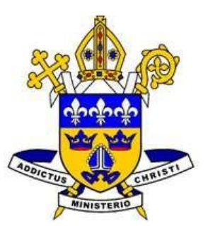
the DIOCESE of EAST ANGLIA

according to the Scriptures, and, in obedience to God's will and in the power of the Holy Spirit commit themselves: to seek a deepening of their communion with Christ and with one another in the Church, which is his body; and to fulfil their mission to proclaim the Gospel by common witness and service in the world to the glory of the one God, Father, Son and Holy Spirit. An ecclesial community which on principle has no credal statements in its tradition, is included if it manifests faith in Christ as witnessed to in the Scriptures and is committed to working in the spirit of the above.